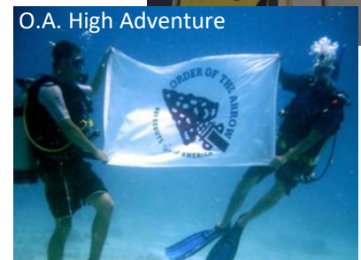
O.A. High Adventure